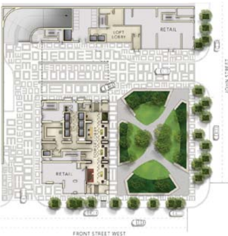
Ground Level Amenities