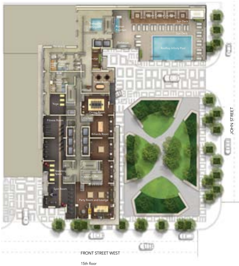
15th Floor Amenities