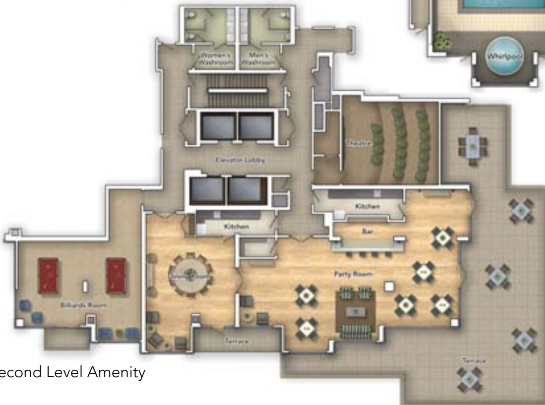
Second Level Amenity