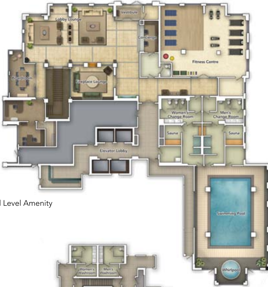
Ground Level Amenity